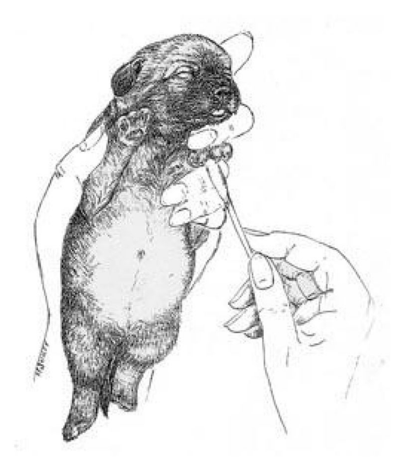
Figure 2 Head held erect