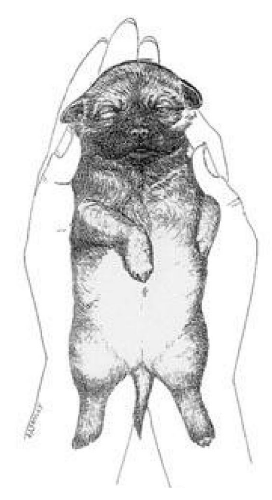
Figure 5 Thermal stimulation